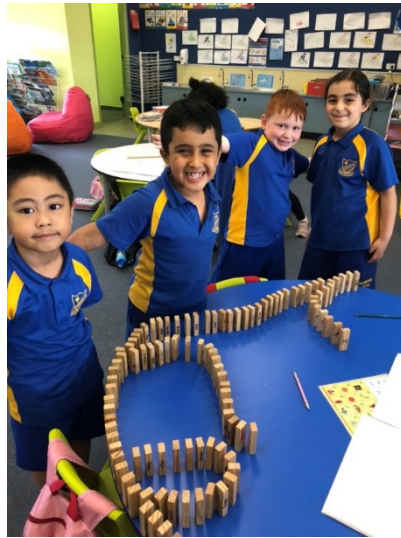
Sight word dominos