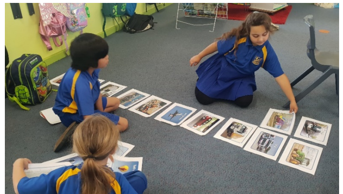
Connecting and collaborating through art