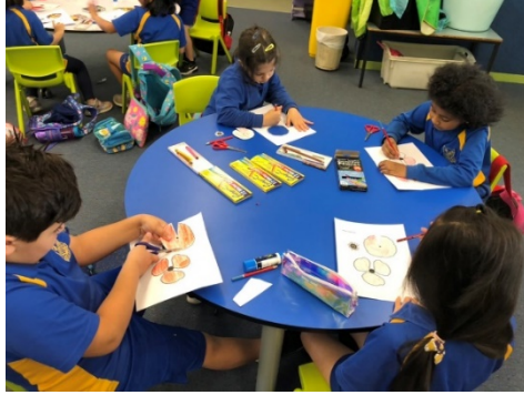
Making poppies for Remembrance Day

Even if I'm not sure, I have a go. I learn from and am better because I make mistakes.