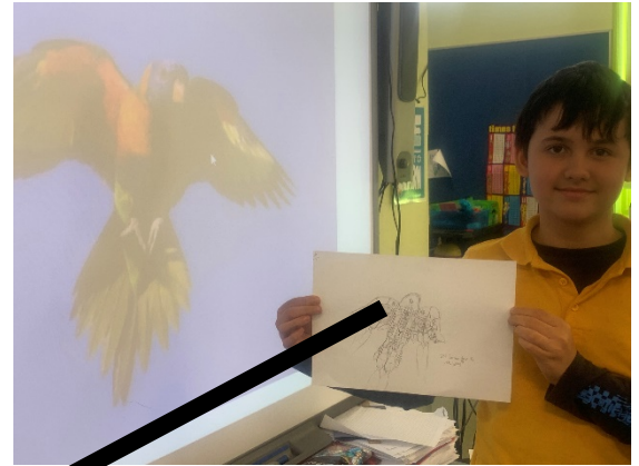
Designing space ships based on the aerodynamic designs of some of our birds and animals